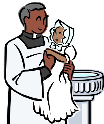
A joyous occasion!