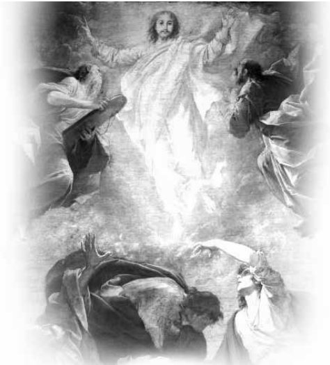
FEAST OF THE TRANSFIGURATION OF THE LORD

-EWTN, Electronic Copyright © 1996 New Advent, Inc., All rights reserved.